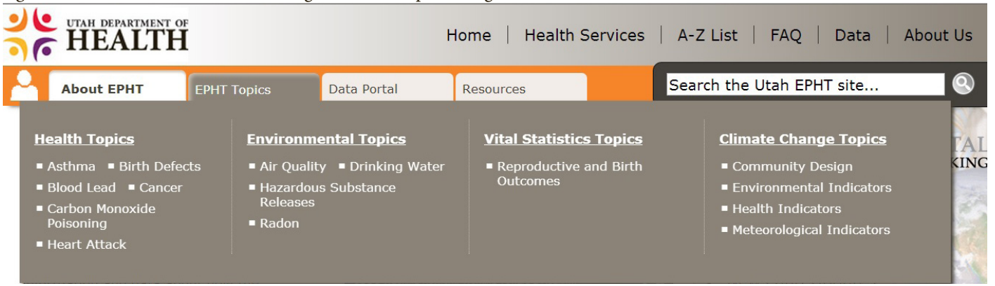
Figure 1. New UEPHTP Website Showing the EPHT Topics Navigation Bar